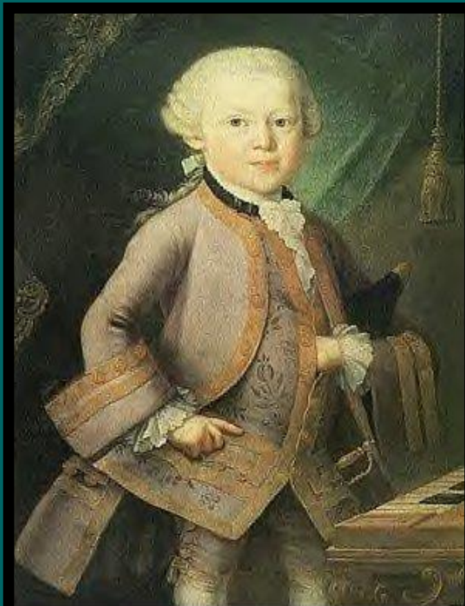
Wolfgang in gala costume, probably painted by Pietro Antonio Lorenzoni, 1763. The costume was a gift of the Empress Maria Theresa.